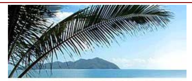
MISSION BEACH HOLIDAYS & RENTALS