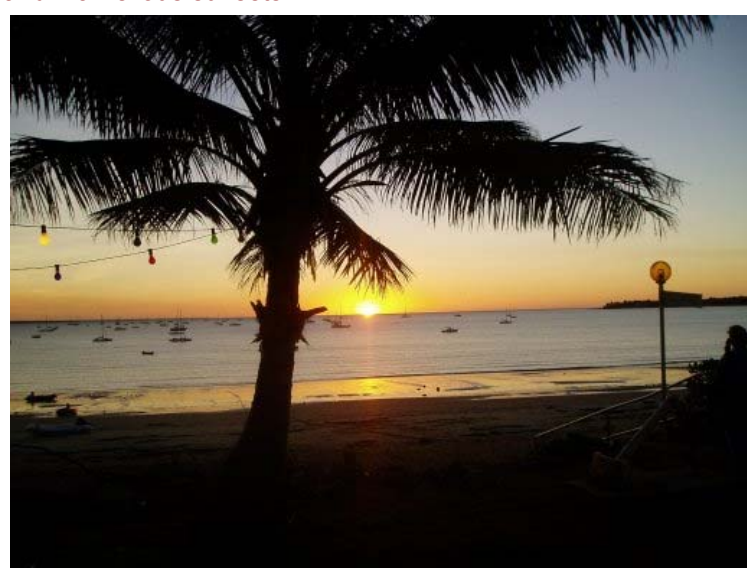
See you there, Fiona McManus