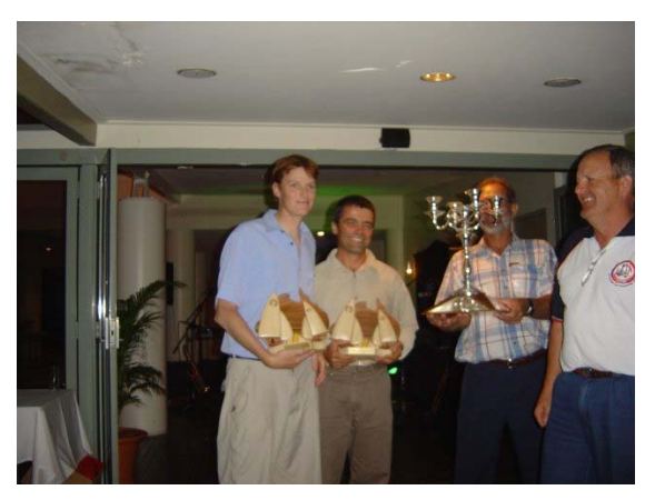
A lot of opportunities to sail conservatively on the shifts

I tend to be a traveller player most of the time but found myself using the mainsheet probably 80% of this series. The traveller was cleated about 10-15 cm above the centre and that's where it stayed. The mainsheet gives a much quicker response to pressure changes and in the lumpy water allows you to accelerate much faster. NEVER cleat both.