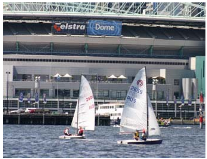
A different sort of sailing backdrop

On the water there were enormous swings and shifts both in the wind and in the place getters - there were 4 individual heat winners, and a lot of individual last