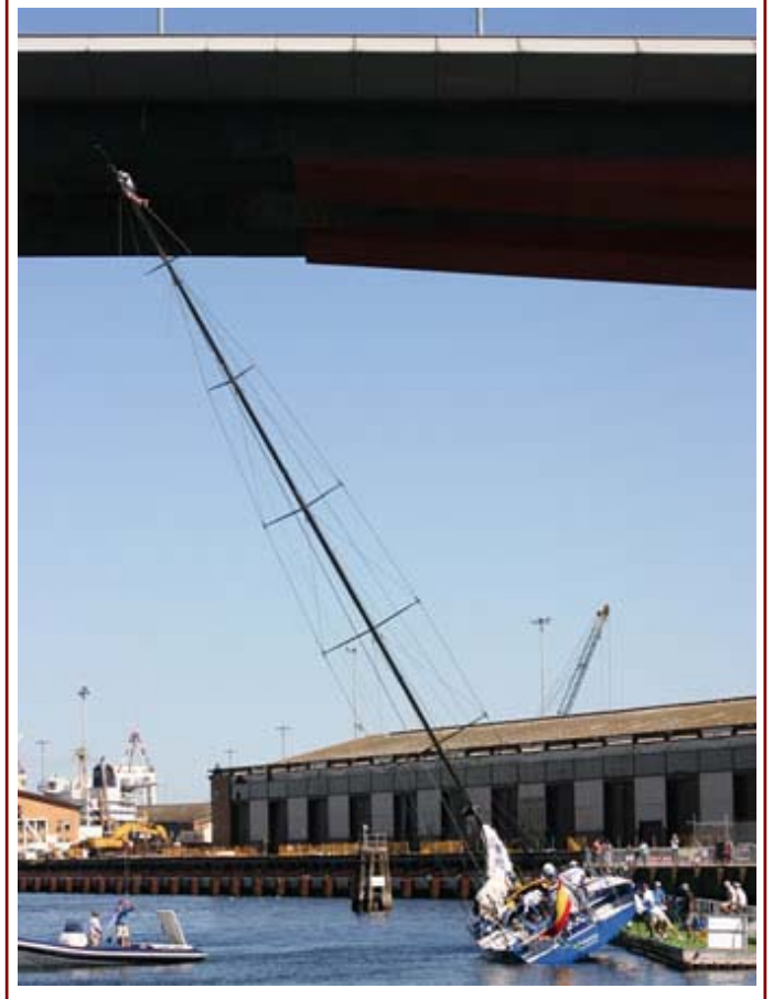
How to get your Volvo Open70 under the Bolte Bridge. Cant the keel, winch your self over whilst attached to a heavy rubber duck and hoist a crew member to the top of the mast to make sure you don't hit whilst being walked under the bridge. Simple!