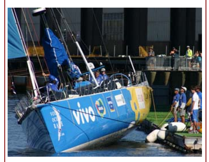
Brasil 1 doing the Bolte Bridge shuffle

Sunday morning saw most of the sleepy-eyed Tasar fleet back at the docks for a breakfast BBQ while watching the Volvos head out to start the next leg of their race. The manoeuvring to get a boat with a 31m mast under a bridge with a clearance of 29 metres made it well worth the early start.