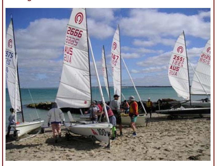
On the beach at RB, November 2005

The Tasar fleet in Adelaide is based at Somerton. Energy in the class has been high since Darwin where we had 12 boats sailing. We would be interested in finding out if that number of boats was exceeded by any other visiting club at the Darwin Worlds.