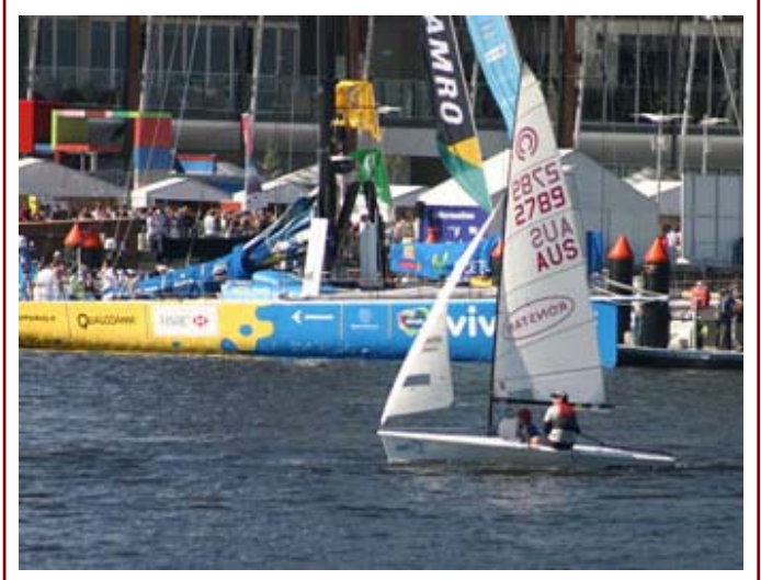
SheepStations and Brasil 1 who wouldn't come out and play

Eleven intrepid Tasars jumped at the opportunity to be part of the Volvo Melbourne Stopover festival at the third annual Docklands regatta, and numerous other