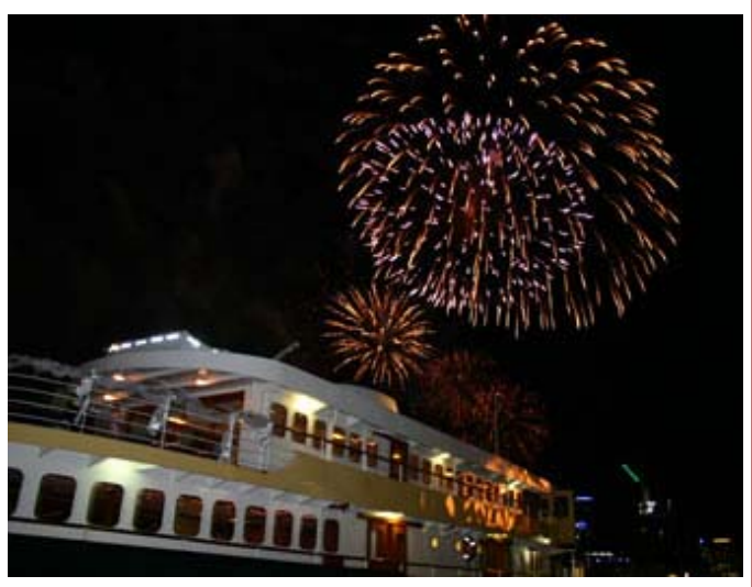
Saturday night fireworks over Docklands