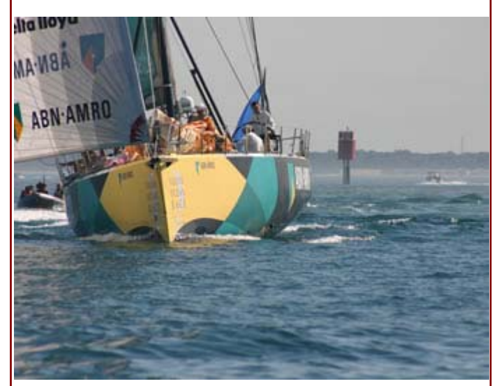
This keelboat came through the race course one recent Saturday at McCrae. Tried calling "starboard" but they didn't take much notice!