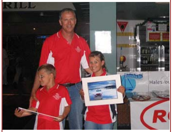
Team Tallis collecting their trophies

Remember it's a holiday. If you've never been to WA before, give yourself at least enough time to do the