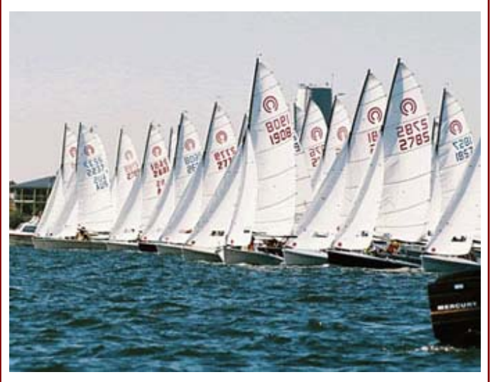
Don't forget the Vic State Titles are on 11-13 March at Yarrawonga YC