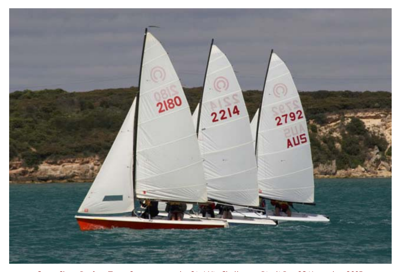
Cover Shot: Perfect Tasar Symmetry at the SA / Vic Challenge, Rivoli Bay SC November 2005

Newsletter of the Australian Tasar Council Inc