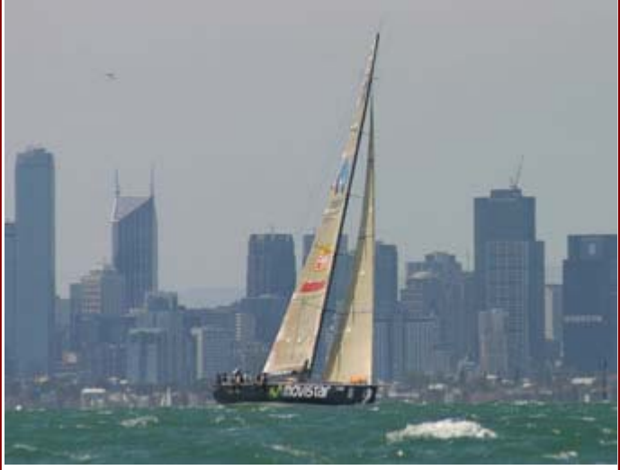
movistar in Melbourne

NB Took over 300 shots while they were in town. Will post selection on gallery when time permits.