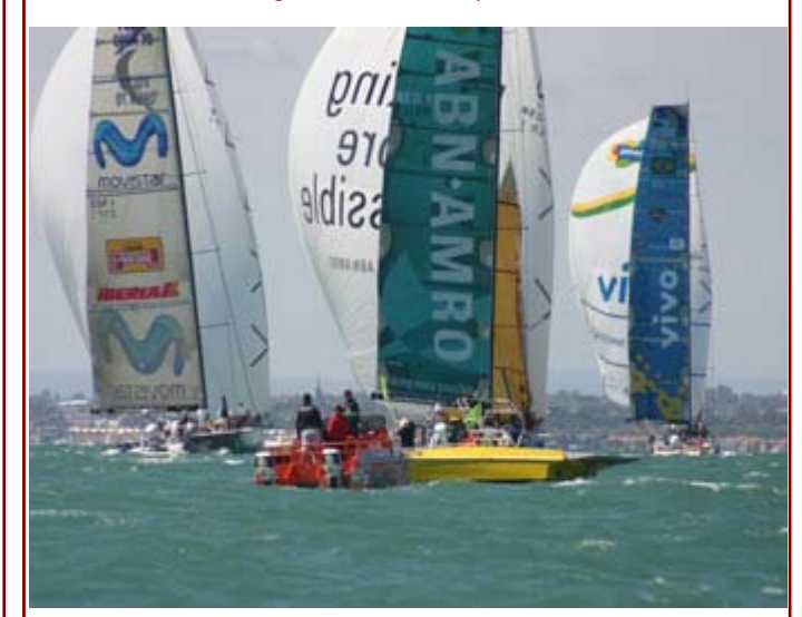
From Melbourne InPort race— bloody spectator boats!