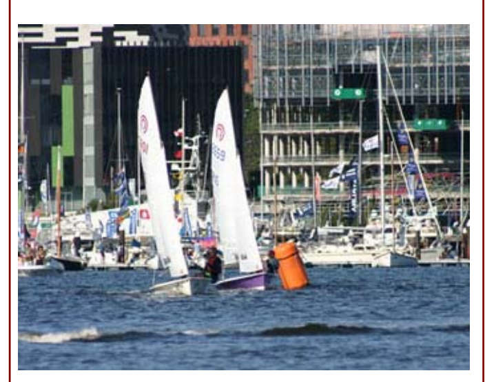
Wotchamacallit and Hakuna Makata dicing with the boat show activity in the background