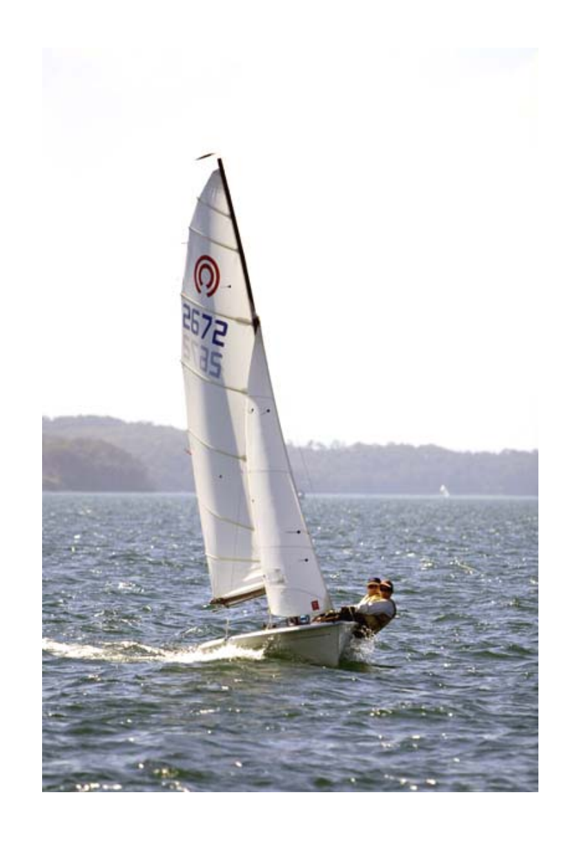
December 2002 www.tasar.org.au